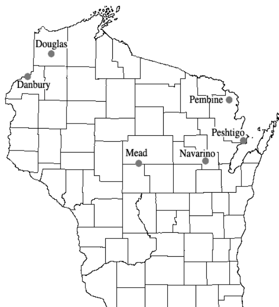
Figure 1: American Woodcock collection sites 1999–2001.

American Woodcock .—Detailed methods of woodcock sample collection and analysis can be found in Strom et al. (2005). Briefly, woodcock were harvested between 1999 and 2001 at selected locations in Wisconsin using steel shot (Figure 1). Birds were collected a minimum of two weeks prior to the regular hunting season (late September through early November) to increase the probability that only locally exposed birds (young of year) would be collected. Woodcock age and sex were determined via plumage characteristics as described by Sepik (1994). Pointing dogs were used to assist in finding woodcock nests and broods. When a brood was found, one chick was randomly selected and