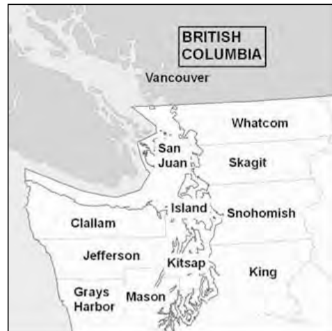
Figure 2. A schematic of county boundaries in northwestern Washington State.

ada, The Trumpeter Swan Society, and the University of Washington (Washington Cooperative Fish and Wildlife Research Unit). Rocket propelled nets were used to capture a total of 249 Trumpeter and 42 Tundra Swans between 2001 and 2005. A blood sample was collected from each captured swan and analyzed for blood lead content (BC Ministry of Agriculture and Lands, Animal Health Centre, Abbotsford, BC.). Trumpeter Swans were fitted with either a VHF (n=243) or satellite (n=6) transmitter attached to a coded neck collar. Tundra Swans were fitted with a coded neck collar. Sick and dead swans were collected throughout the winter, and carcasses examined to determine cause of death, measure liver lead residues, and recover shot from gizzards. Results suggest that swans arrive on the wintering grounds with low blood lead levels, but some birds subsequently become exposed to lead after ingesting lead shot.